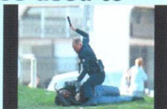
© 2015 by the author. All rights reserved. #LAWENFORCEMENT #POLICE #COURT #JUDICIAL #LEGAL #LAWYER #ATTORNEY #PROSECUTOR #DEFENSE #COURTROOM #JURY #TRIAL #EVIDENCE #DISCIPLINE #OFFICERS

13. Almost half agree or strongly agree that body-worn cameras could be used by supervisors to 'fish' for evidence used to discipline officers